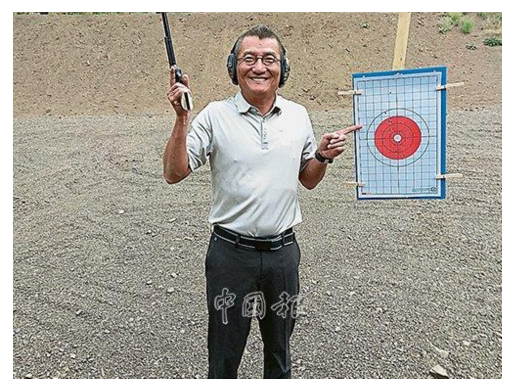
Shooting club has someone to teach how to use all kinds of guns and shooting skills.