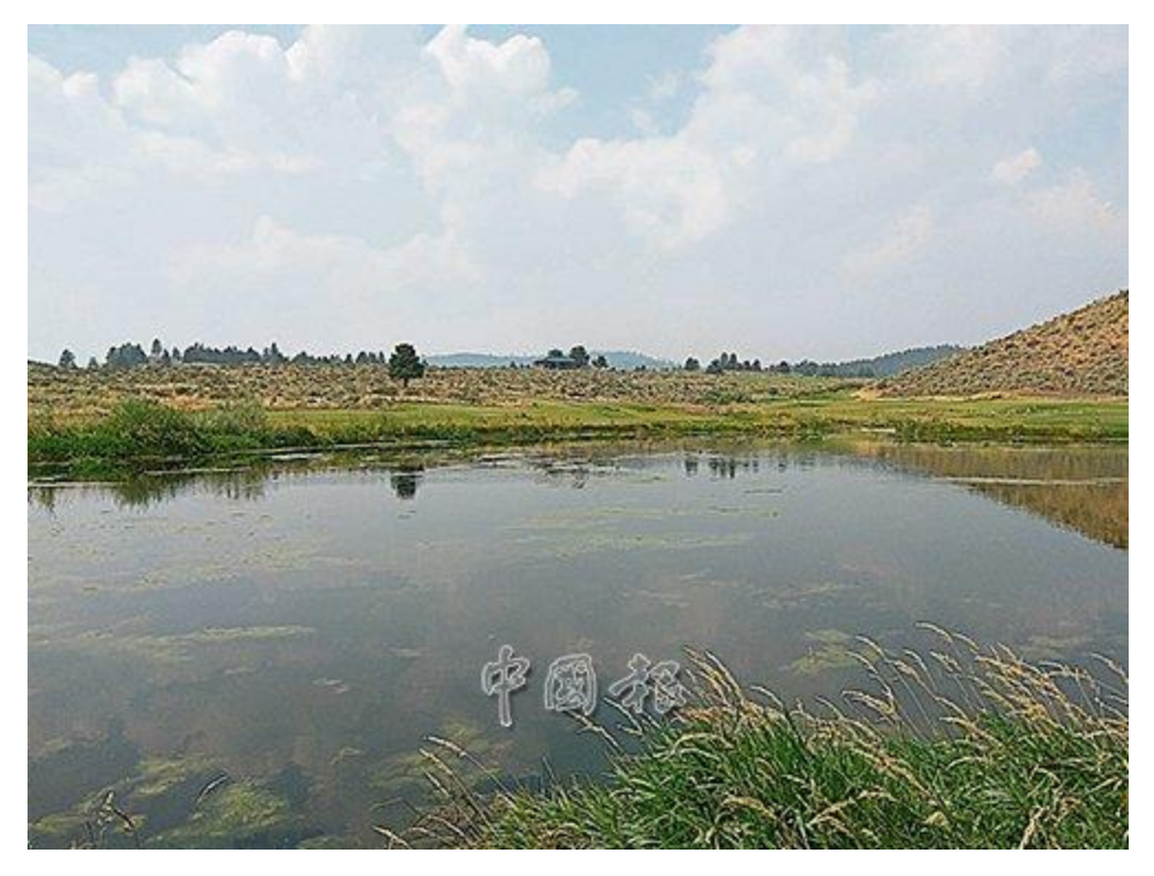
There are mountains and water resort golf course, beautiful scenery