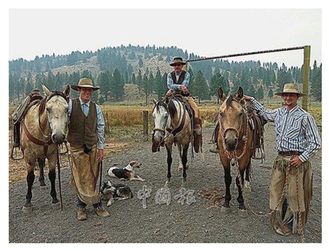
Here is a large livestock farm with thousands of heads of cattle and sheep. Travelers visit the resort you can visit the ranch chatting with the cowboy.