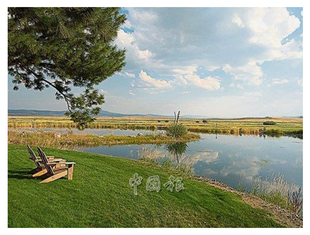
Resort Lake, sitting here to enjoy the sun, really happy too.